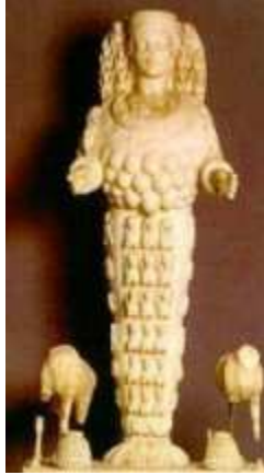
EPHESUS: Temple of Artemis, one of the Seven Wonders of the Ancient World; St. Mary's Cottage and Sacred Well