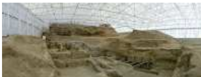
ÇATAL HOYUK: Neolithic site where the Mother Goddess was revered and venerated