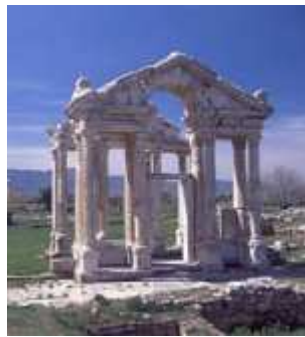
APHRODISIAS: Temple of Aphrodite