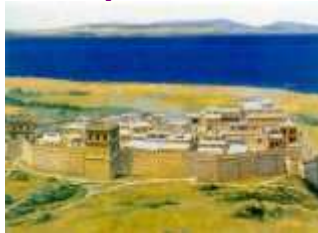
TROY: Temple of Athena

PERGAMON: Temples to Athena, Isis and Serapis